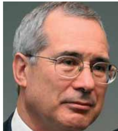
Sir Nicholas Stern

2006 has been another very active and successful year for the Forum. Concerns about CG and CSR remain high on the agenda, making our role as important and relevant as ever. Public awareness of the dangers of climate change has increased dramatically; as has